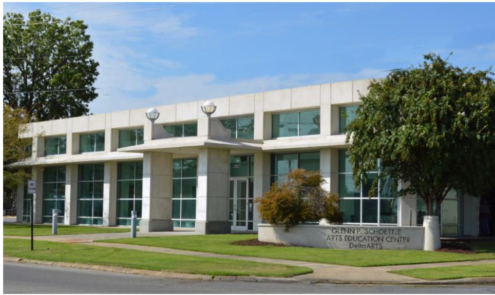
DeltaARTS' new home: The Glenn P. Schoettle Arts Education Center