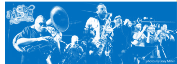
Parades & Celebrations by Mighty Souls Brass Band