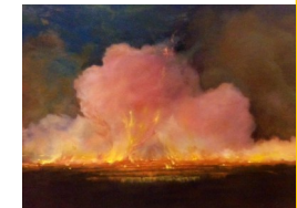
Earth, Wind & Fire

June 27-29, 2016 8:30 a.m.-3:30 p.m. Academies of West Memphis Performing Arts Center West Memphis, Arkansas