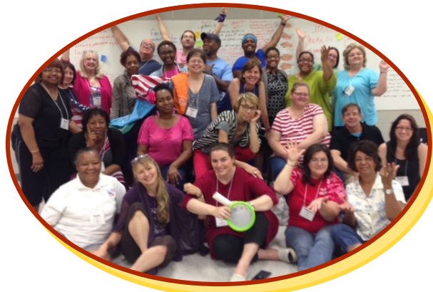
2015 Educator Workshop participants