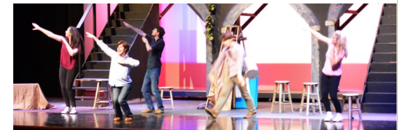
It's All Greek to Me by Voices of the South